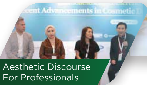
Aesthetic Discourse For Professionals